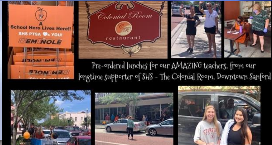
Pre-ordered lunches for our AMAZING teachers, from our longtime supporter of SHS - The Colonial Room, Downtown Sanford